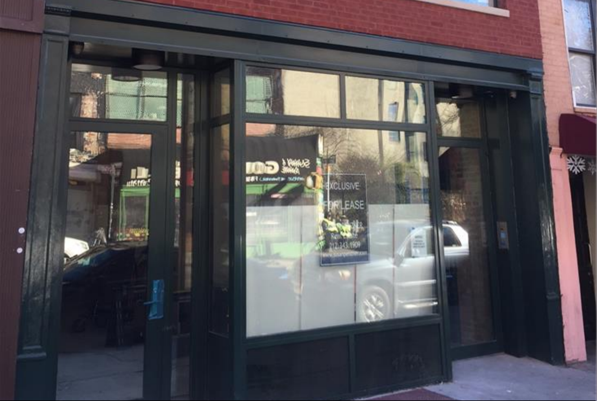
95 Avenue B between 6 th and 7 th Streets SUSAN PENZNER Real Estate Exclusive